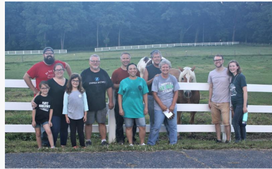
Goshen First Brethren Church Work Group

Thank you for all of the hard work from Elkhart 4H Dairy Feeder Club and Goshen First Brethren Church . With your help we are ready for our biggest semester yet!