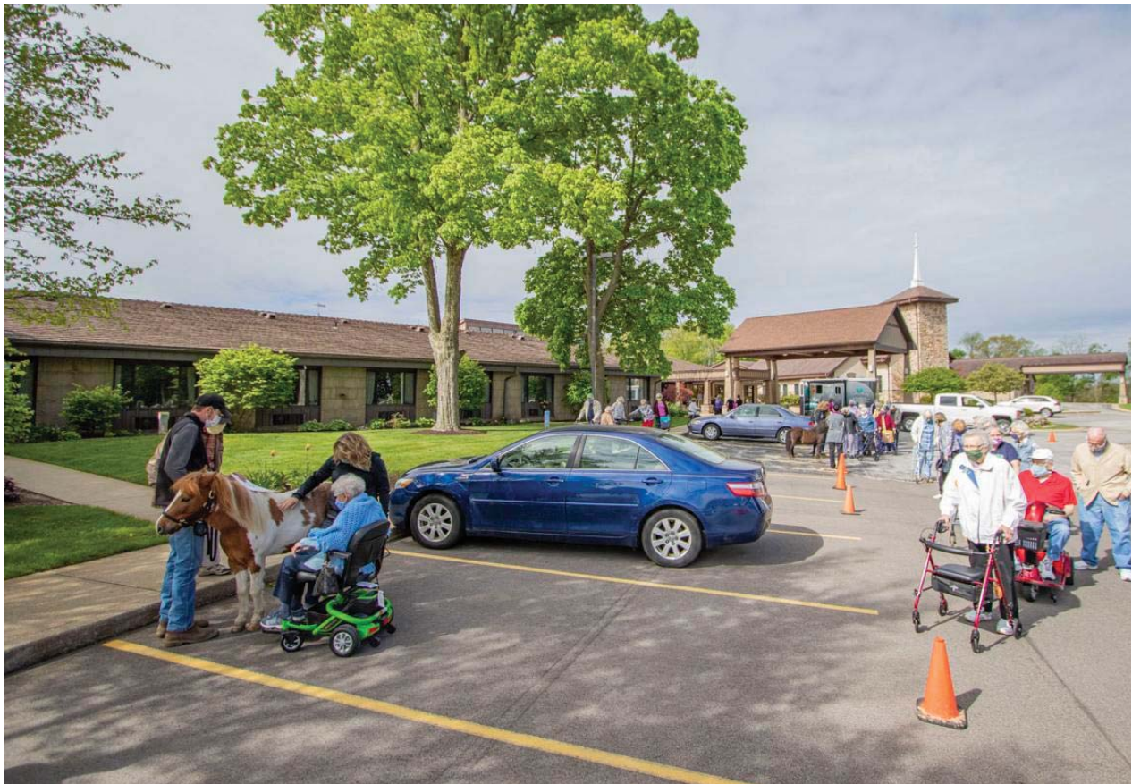
Hubbard Hill Living Wisdom Community residents line up to meet LoveWay miniature horses Peeps and Yoshi Thursday morning at Hubbard Hill Living Wisdom Community in Elkhart.